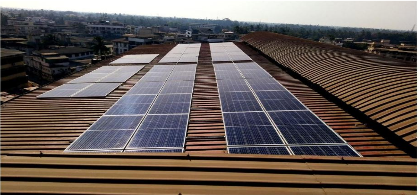
R.B Harris Jr. College, Sopara(W) : 20 kWp