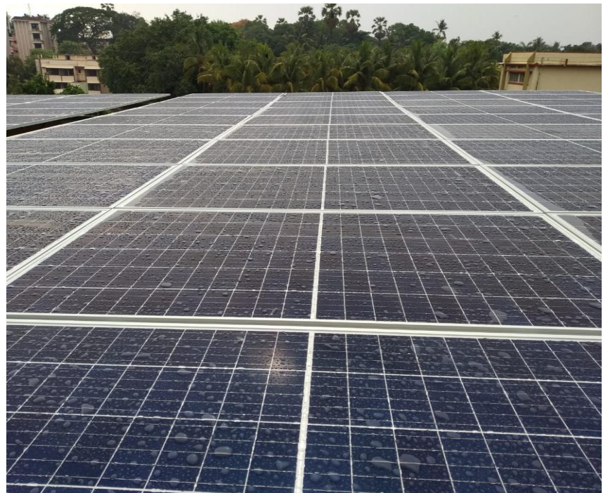
Creative Handicrafts, Andheri (E), Mumbai Total Combined Capacity : 51 kWp