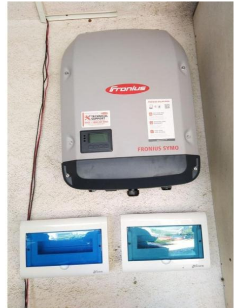
Villa Kiara, Andheri (W), Mumbai :5 kWp