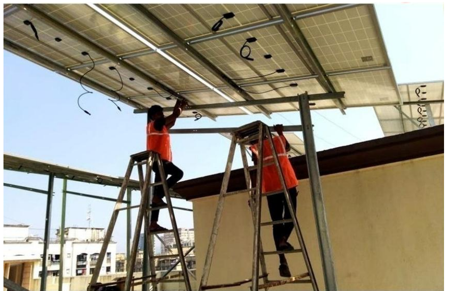
Noorani Masjid, Malad (E) : 25.5 kWp