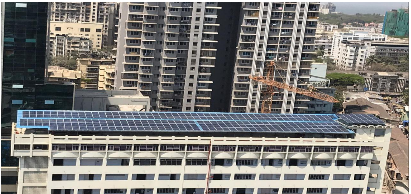
Maharashtra College, Mumbai : 84.5 kWp