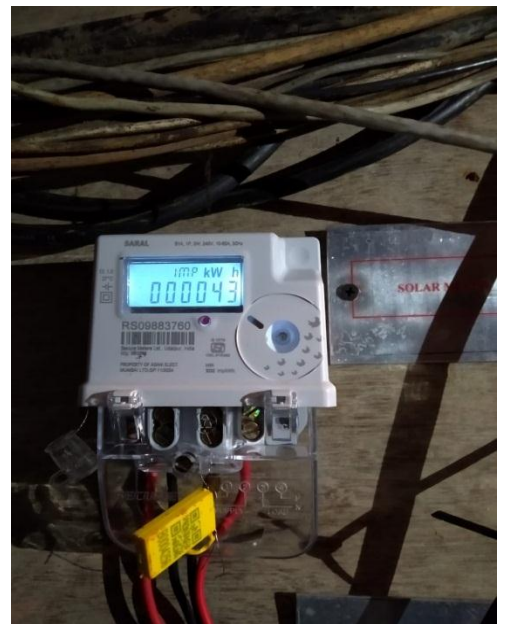
Casa Feliz, Santacruz (W), Mumbai :3.6 kWp Automated Solar Panels