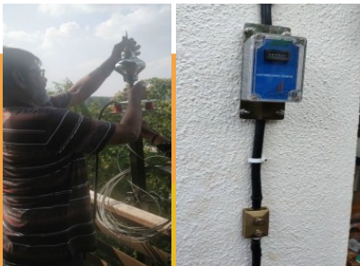
ESE Lightning Arrester