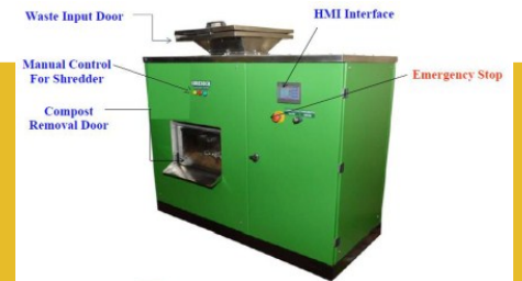
Organic Waste Composting Machine