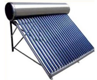
Solar Water Heaters