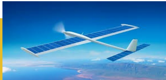
Thin Film Solar