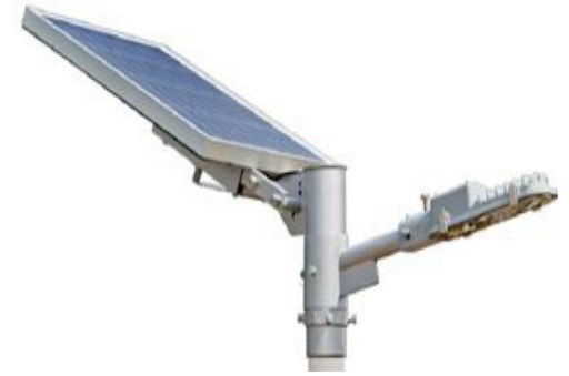
Solar Street Lights