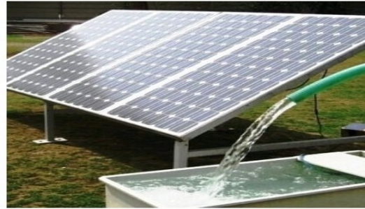
Solar Water Pump Installation