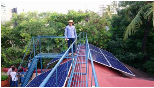
Solar For Residential