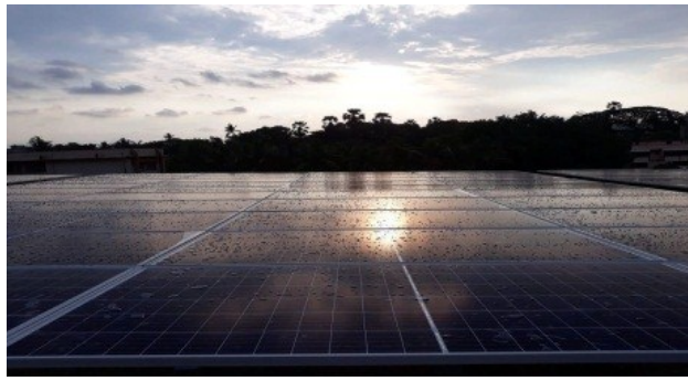
Solar For Business