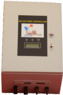
Solar Water Pump Controller